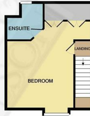
2ND FLOOR APPROX. FLOOR AREA 284 SQ.FT. (26.4 SQ.M.)