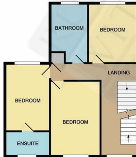
1ST FLOOR APPROX. FLOOR AREA 526 SQ.FT. (48.8 SQ.M.)

TOTAL APPROX. FLOOR AREA 1416 SQ.FT. (131.5 SQ.M.)